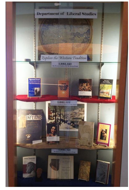
Wilson Library display case highlighting the Western Tradition course series, located near the Circulation Desk.

And then occasional support for gatherings of students, alumni and faculty at which we continue dialogue and exploration !