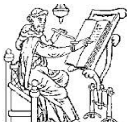
Our faculty at their labors

How do the dollars work given to the Liberal Studies Foundation by kind donors?