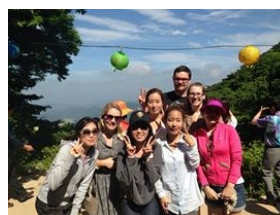
At the mountain's top

After about an hour of walking on a winding mountain path, I am near the summit of Mount Toham and overlooking the East Sea.