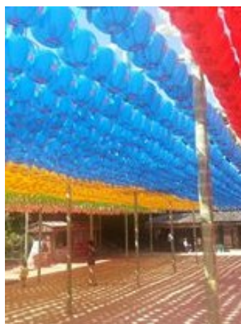
Mount Toham's lanterns