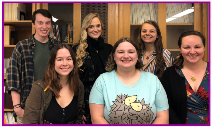
Leadership Team participating in the 2019 Fall Info fair!