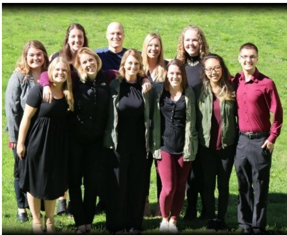
Pictured (left to right):