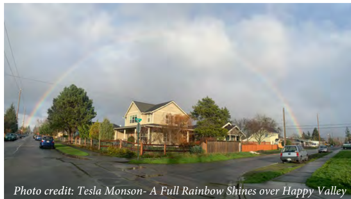
A Full Rainbow Shines over Happy Valley

On a personal note, it's incredible how I just can't seem to get sick of all the beautiful views around Bellingham and the Salish Sea. As the sun starts to pop out again, and as we start dreaming of Spring and Summer, the shimmering water and towering mountains give me no small amount of inspiration. I am so happy to share this academic and educational journey with you all, and I can't imagine doing it anywhere else. Thank you!