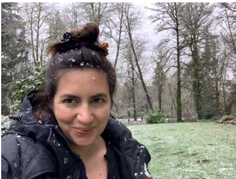
Tesla enjoying the first snow of the year