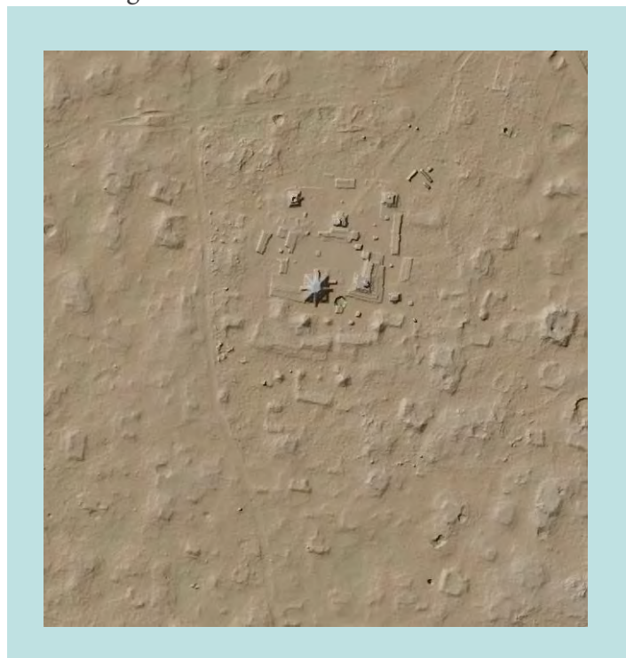
LiDAR bare earth image from the site of Mayapan, Yucatan, Mexico. These data – generously shared with us by the Mayapan Archaeological Project – are the foundation for the training and evaluation of an automated archaeological feature identification system in collaboration with students and faculty from the WWU Computer Science program.