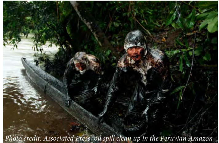
oil spill clean up in the Peruvian Amazon

Well, the light at the end of that tunnel may not be an oncoming train after all. Much work in 2019/2020 completed by the Nutrigenomics/Nutrigenetics lab team focused on developing bilingual research tools to address the nutritional component of the KU study entitled “Genetic-Environmental causes of diabetes mellitus 2.0 in Amazonian Populations of Peru. As a result, the grant from KU Diabetes center awarded the WWU lab pilot access to test a substantial nutritional software program. The pilot crew from the University of Kansas traveled to Yurimaguas, Peru, in Feb 2020. Due to unexpected political constraints in the area, the crew concentrated primarily on collecting blood samples to identify the prevalence of DM2 in this population and data collection addressing the nutritional environmental component was minimal. While some of the medical biomarkers were analyzed in Yurimaguas, the specific genetic samples were frozen at an American lab in Lima, as the onset of Covid-19 closed US transfer options. The KU IRB paused all human subject studies while Covid ravaged the Peruvian populations along with many other countries. Now twenty months later, the DNA is ready