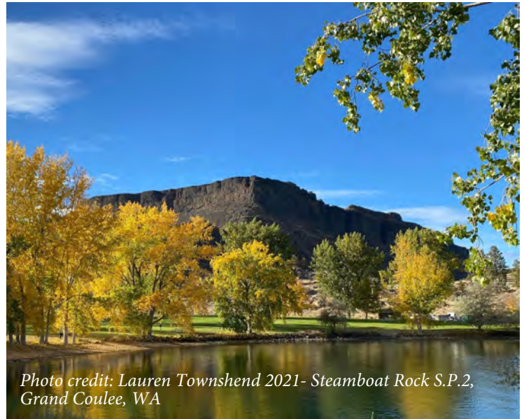
Steamboat Rock S.P.2, Grand Coulee, WA