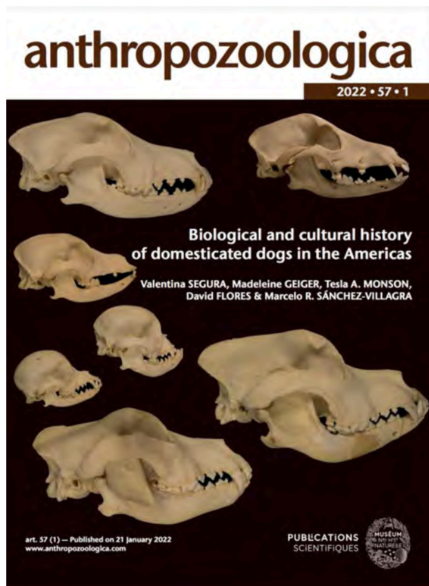
Tesla's paper published in collaboration with The Primate Evolution Lab: Biological and Cultural History of Domesticated Dogs in the Americas

classroom. We are all currently undergoing training on the machine, and we look forward to sharing 3D scans with the Western community over the next quarters.