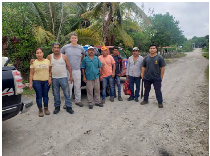
Field Crew for the Proyecto Arqueológico Uxte'tuun

Perhaps the most important development in my own career has been a shift towards increasing engagement in research endeavors in western Washington. I am co-directing a new collaborative research project undertaken in partnership with the Stillaguamish Tribe this summer. This indigenous-led program will