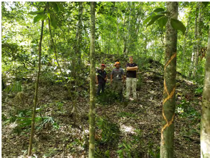
Preliminary mapping of the site of Chanmul

and graduate degree programs and professional positions in academia, cultural resource management, historical preservation, and cultural heritage. The next chapter of the WWU Archaeological Field School will continue the learning objective of providing participants with practical experience that will make them competitive on the job market. However, the broader goal of the