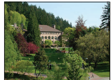
WESTERN WASHINGTON UNIVERSITY

"Two of our former students who have completed their PhD's will be teaching in our program next year."