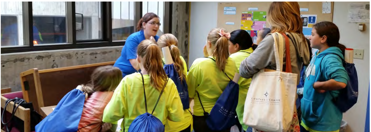
Compass 2 Campus