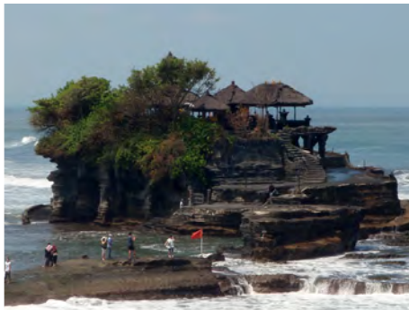
Pura Tanah Lot, a land-sea temple significant in the introduction of Hinduism to Bali, Indonesia. You are supposed to express gratitude for the beauty there, sometimes religion comes naturally