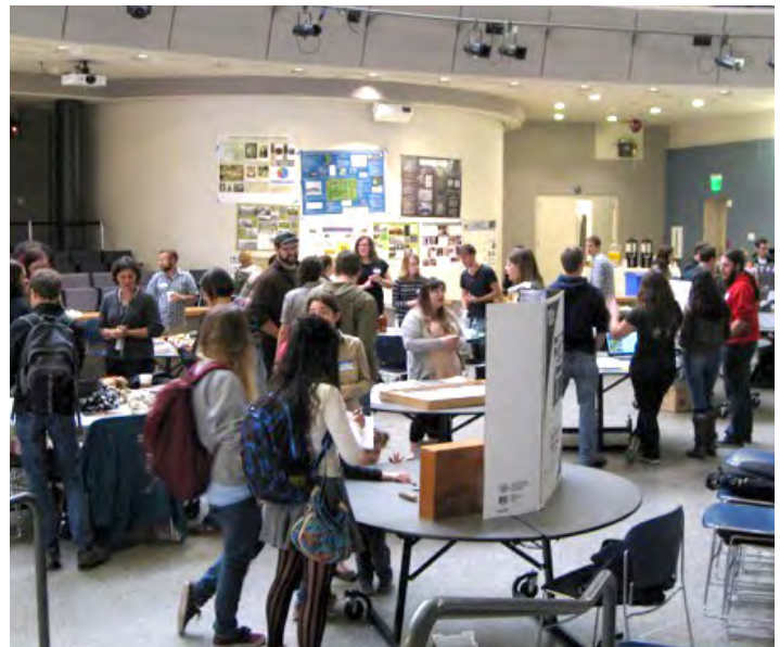
Archaeology Fair, October 28, 2015 Whatcom Community College