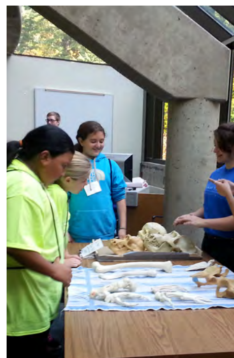
Compass 2 Campus