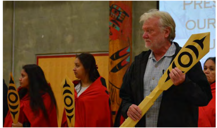
Quileute Ceremony November 21, 2015

By the time you are reading this I will be sunning myself in Tucson and working on the other two projects that have been in the works for a while, both in British Columbia.