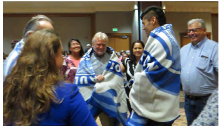
Quinault Ceremony July 19, 2015