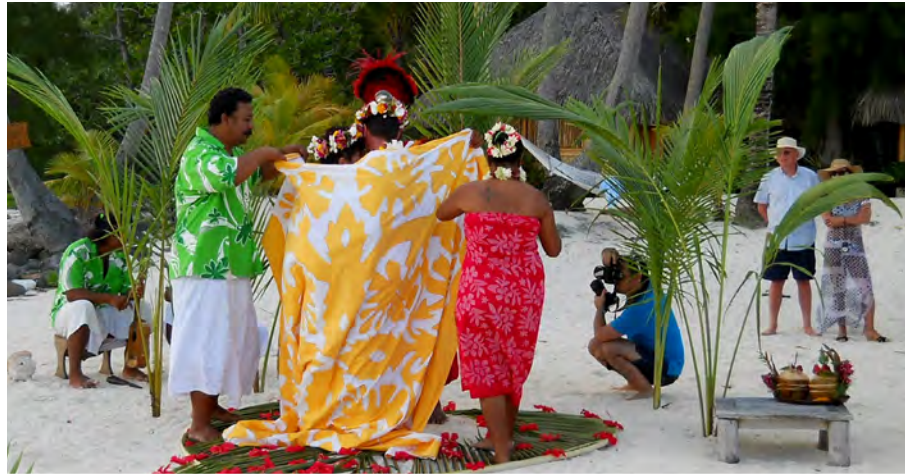
A tifaifai is wrapped around a couple marrying on the island of Bora Bora in the Society Islands.

going back to A/N.Z. after nearly 40 years. I spent almost a year there taking classes at the University of Auckland and doing my first stint of fieldwork among Maori women who were making traditional crafts to fund a community center and Maori meeting house.