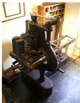
They used the newly invented Stanhope Press.