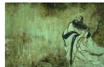
The great 5th century Chinese poet, Xie Lingyun.

And on April 18, in conjunction with the East Asian Studies Program, the department also brought up to Western the esteemed UW scholar David Knechtges, to speak on the mountain poetry of Xie Lingyun.