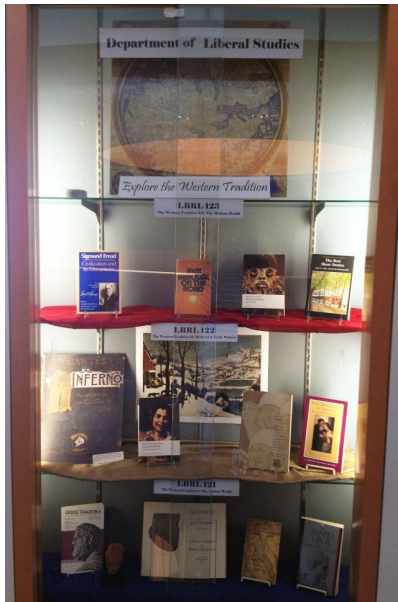
Wilson Library display case highlighting the Western Tradition course series, located near the Circulation Desk.

How do the dollars work given to the Liberal Studies Foundation by kind donors?